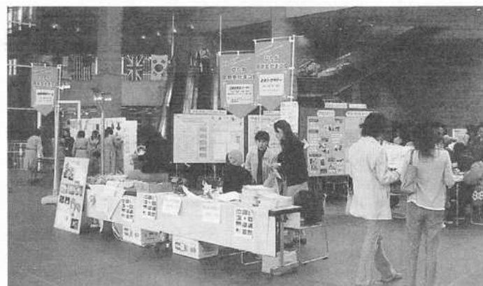
First floor Information desk

On the fourth floor, foods of various countries were served by their native volunteers. On the seventh floor, a Chinese professor of Ibaraki University gave a lecture on the comparison of the ancient culture between China and Japan, especially from the viewpoint of the succession of the Imperial Throne.