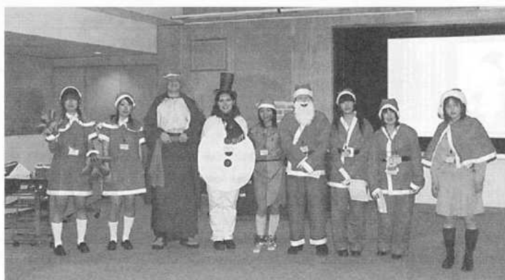
Santa Claus by volunteer