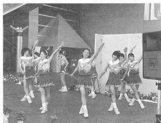
Dance by Students